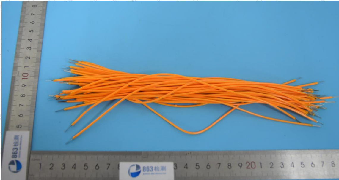
Photo of the sample